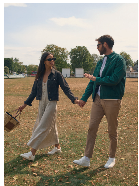
4 MIN WALK TO TWICKENHAM GREEN