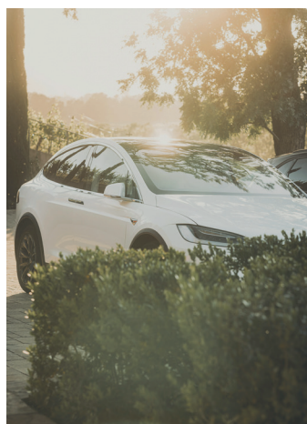
PRIVATE CAR PARKING