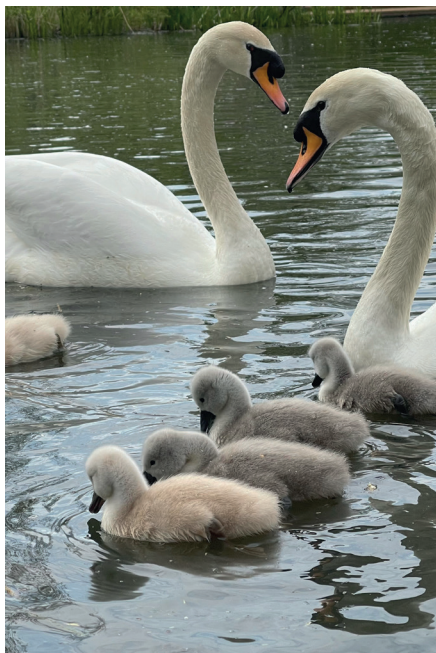
LOCATED NEXT TO THE RIVER CRANE