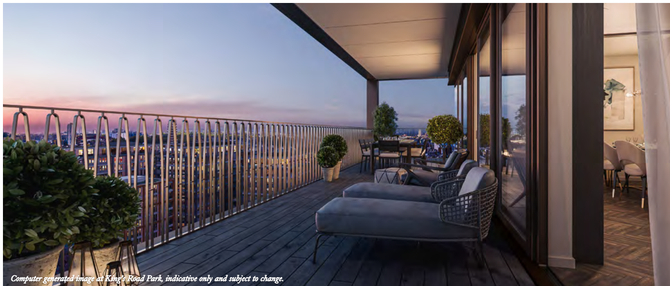
Computer generated image at King's Road Park, indicative only and subject to change.