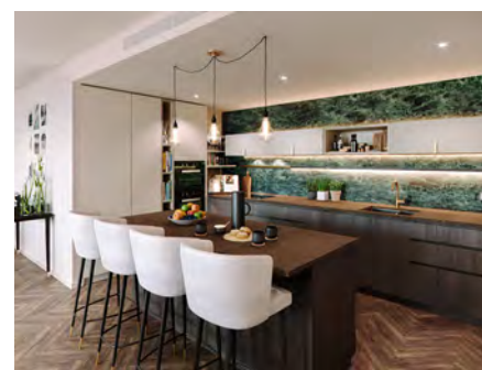
Computer generated image at King's Road Park, indicative only and subject to change.