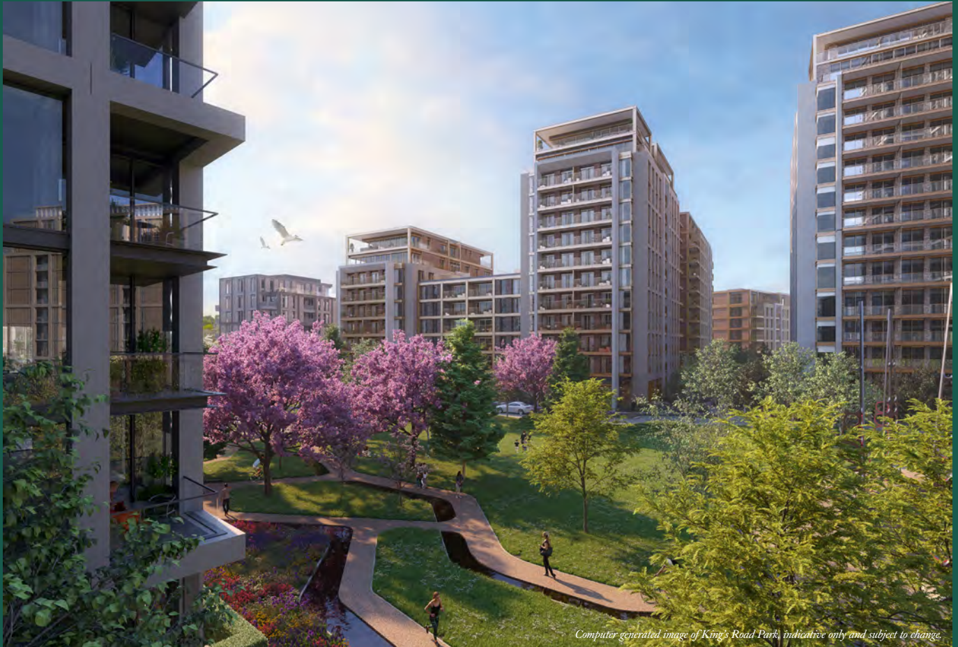
Computer generated image of King's Road Park, indicative only and subject to change.