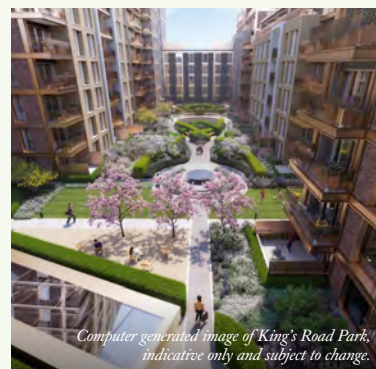
Computer generated image of King's Road Park, indicative only and subject to change.

1st floor podium gardens exclusive for the residents' of Phase 1 only