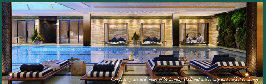
Computer generated image of Swimming Pool, indicative only and subject to change.

King's Road Park is a stylish collection of suites, 1, 2, 3 and 4 bedroom apartments and penthouses set within six acres of beautiful landscaping including a public park, square and residents' garden. Well-being and relaxation can be found all year round in 23,000 sq. ft. of residents' facilities designed in the style of a private members club.