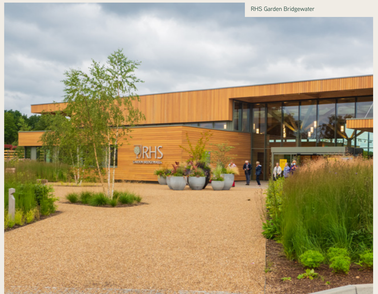
RHS Garden Bridgewater