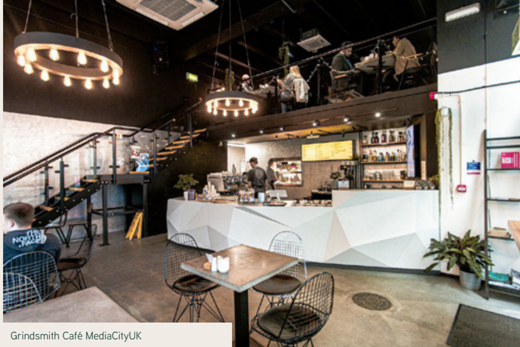
Grindsmith Café MediaCityUK